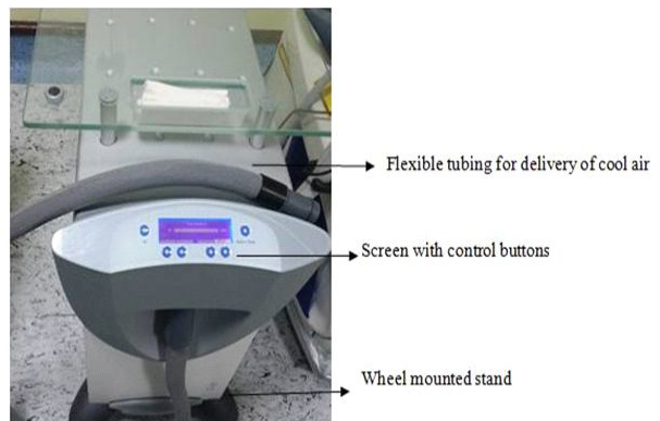
Fig. 2: Systemic skin coolant